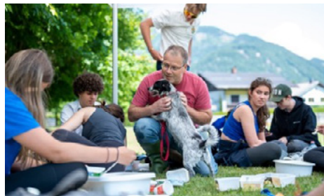
DP students collecting data at the stream

“SOMEWHERE, SOMETHING INCREDIBLE IS WAITING TO BE KNOWN.” - Carl Sagan