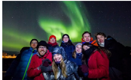
The 2019 Jupiter research team on their way to present their paper on the Jovian aurora at University College London