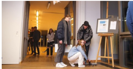
DP students presenting their coursework at the STEM evening

At StGIS we are privileged to have a highly experienced, driven Science team who center integrity, care, and curiosity in all we do. More than anything, students at the school consistently recognise our passion for the subject. The team is full of creative teachers who cultivate the MYP and DP curricula we have designed, as we constantly seek to refine and improve our offering. Students get the best start from an outstanding primary specialist, and, in small classes, our creative, proactive, and patient technician supports teachers and students to inquire in new ways. We model a lifelong love of learning as multiple members of the team maintain an active research profile, and we encourage projects where students can also get involved. We are outdoor enthusiasts (mountain bikers, road bikers, skiers, paragliders, rowers, runners, and more) who aim to leverage our unique surroundings in lessons. More than half the team have been a Head of Department, and we benefit hugely from the experience of our DP examiners and the school's DP Coordinator.